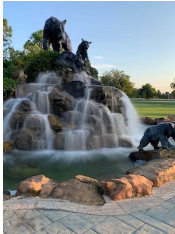
Bear Fountain (above) in Big Fork, Montana.

Checkout the web site exotichardwoodstore.com