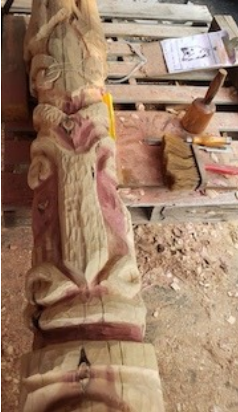
Gary Bennett's totem pole (above). Got about 14 to 18hrs in it right now. This was before the show, more work done during show. For contrast, a glass totem at Crystal Bridges Museum (right).