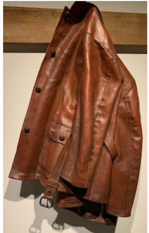
This jacket (also at the Crystal Bridges Museum) was on display during the Craft in America show. I don't remember if it was fashioned from clay or wood but either way the detail is amazing.