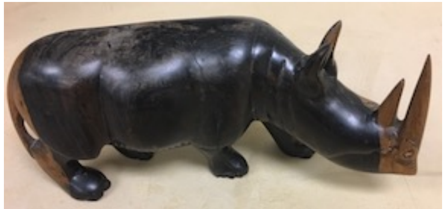
Even More Show and Tell for October: Ken Scrivner brought the beautiful rhinoceros (above). Bill Payne carved the inch worm for a carving contest (right) in Rogers, Ark.

Shop Tip Bench protector To protect your workbench when painting or staining, mount a white vinyl window shade on one end of the workbench. When ready to finish pull the shade across the bench. When the finish dries the shade rolls back up. Shades are inexpensive so can be replaced when they get to dirty