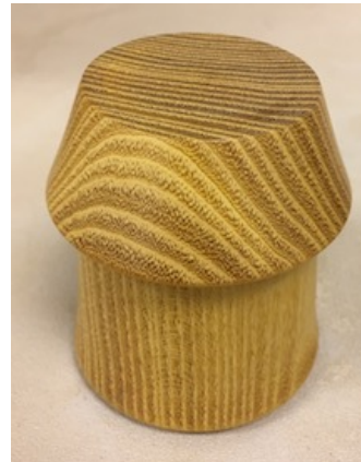
More Show and Tell for October: Two jars turned by Stan Townsend.

Shop Tip Bench protector To protect your workbench when painting or staining, mount a white vinyl window shade on one end of the workbench. When ready to finish pull the shade across the bench. When the finish dries the shade rolls back up. Shades are inexpensive so can be replaced when they get to dirty