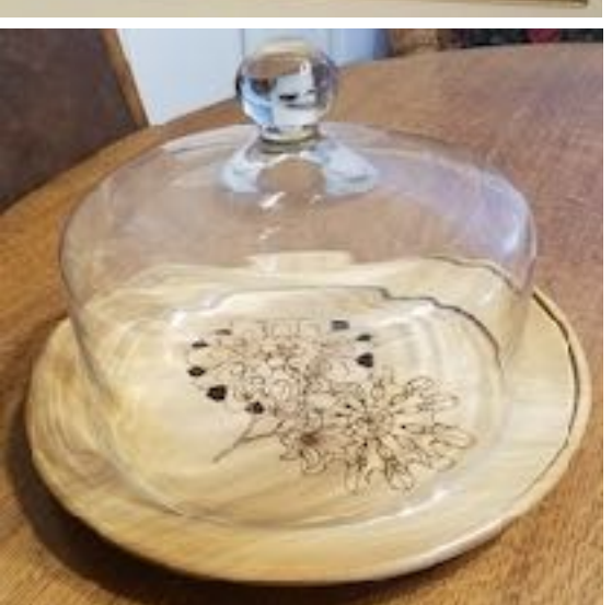
Louise Townsend did the nice batik fabric wall hanging (top) and Stan Townsend turned and burned the cake plate (above).