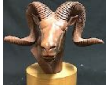
May judging entries: Ram (left and above) and Flower (right). Send me your points as noted above. Your vote will be anonymous.