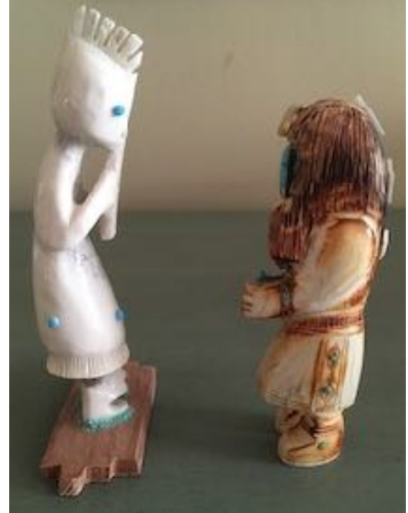
Back view with mother of pearl inlays.