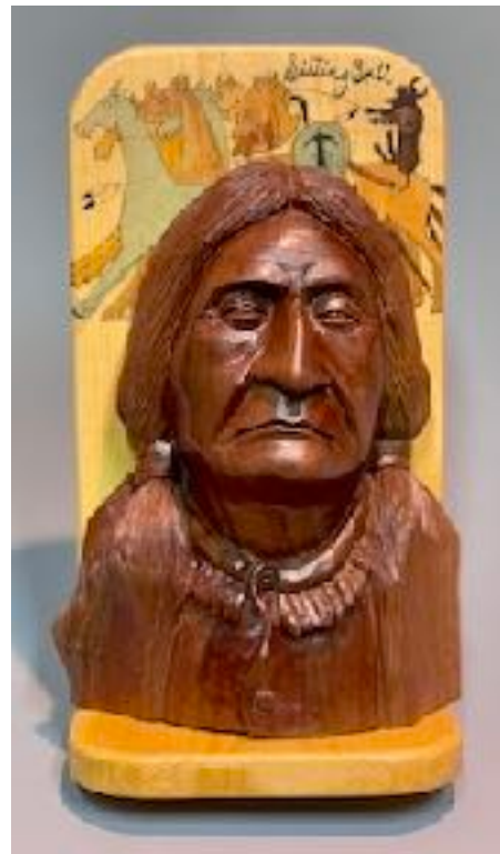
June Judging Bison (above) and Sitting Bull (left).

So far we are averaging three judges voting. PLEASE send me your scores!