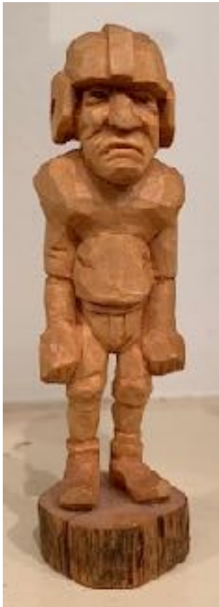
July Monthly Judging: Left is Football Player, bottom right is Horse head.

The show committee met on June 24 and discussed the summer show and the implications of the pandemic. The committee was in consensus that the club members, not just the show committee, should decide whether or not to cancel the show for this year. Since the show involves all club members and the total support of the club is necessary that the committee needs to hear from members about their opinions on this important decision. An email was sent out to all members requesting that they reply with either CANCEL or CONTINUE. The show decision will be announced in the near future.