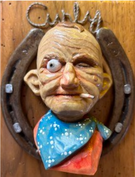
The Caricature Carvers of America also had a competition in conjunction with their show. The contest was for the "Ugliest Cowboy" carving sponsored by Cavender's Western Clothing. Rusty's carving of "Curly" (above) did not win but was fun to do.