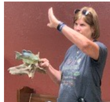
July Show and Tell: A relief carousel (left) done by Bill Burling.