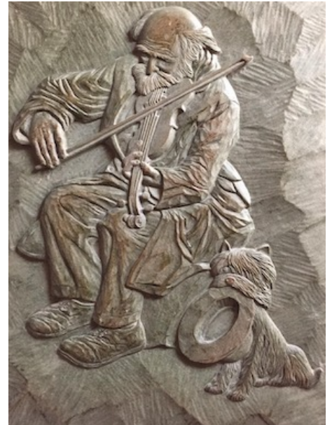
Nice relief carving from unknown source by unknown artist.