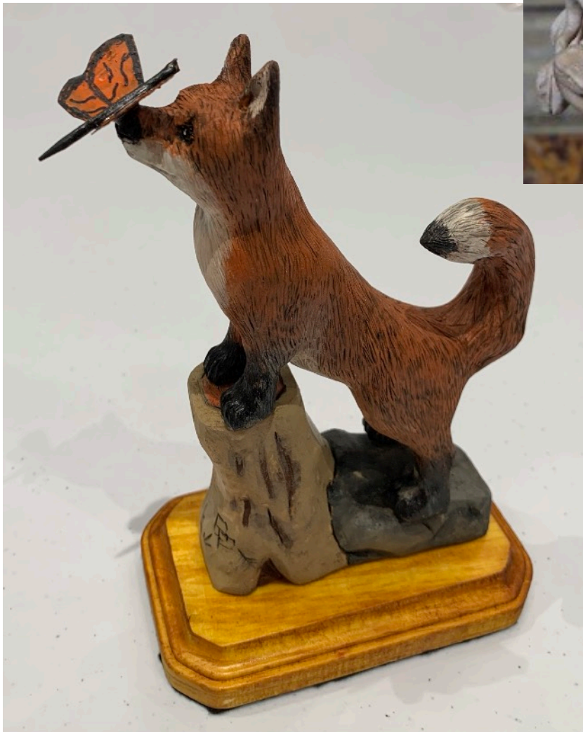
Fox with butterfly carved by Bill Payne (left), based on a greeting card.